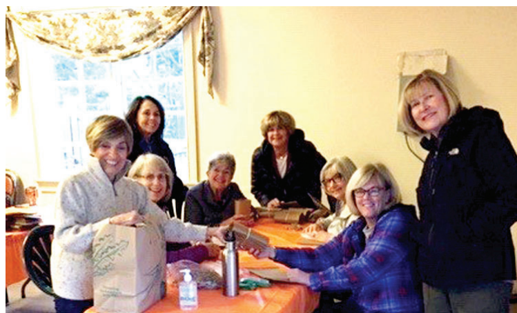
Wheaton-Naperville Chapter Wrapping for Luminaria Fundraiser