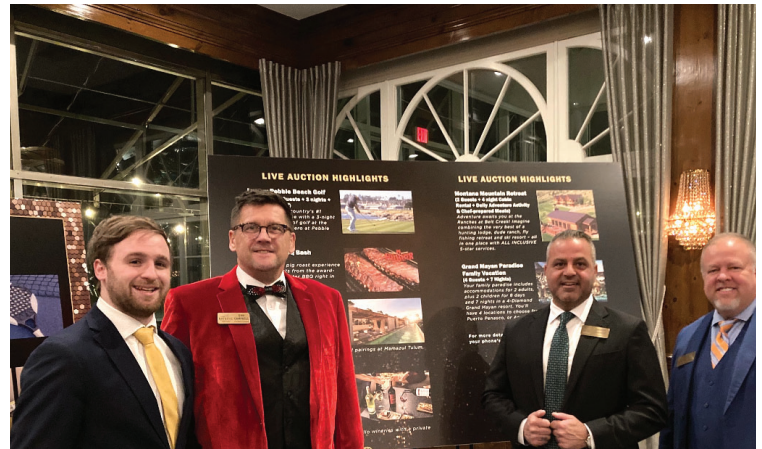
Clarendon Hills Chapter Auctioneers at Light Up the Night Event