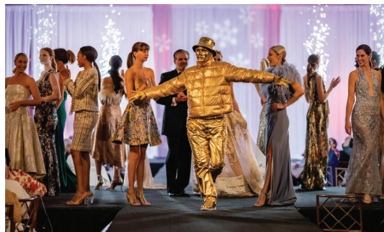
Oak Brook Chapter Mistletoe Medley Fashion Show