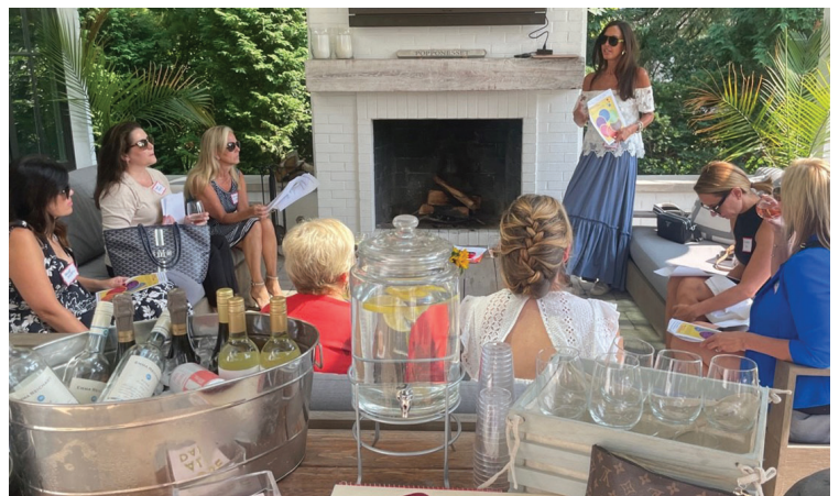
Hinsdale Chapter Discuss Why Tours of the Center Matter