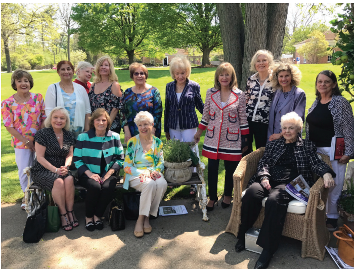
Oak Brook Chapter Supporting Lake Forest Showhouse Event