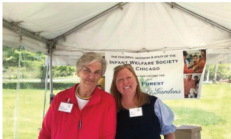
Lake Forest Chapter Members Handing Out Showhouse Guidebooks to Guests

Fundraising/Special Events: Golf & Bridge Outing, Luminaria Sale, Bean Soup Meals, Bridge Groups, AngelBaby Bags, and Coat Drive