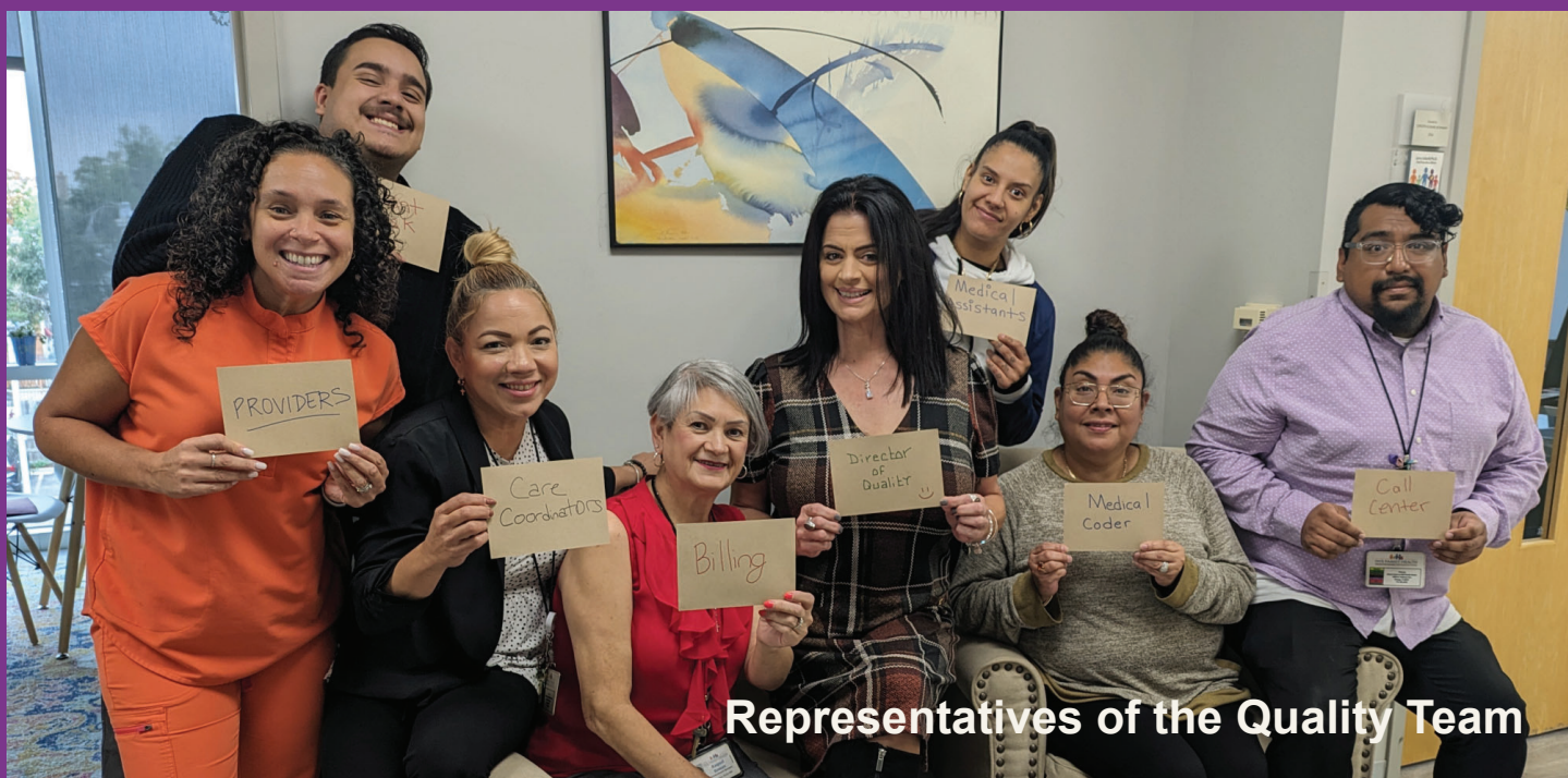
Representatives of the Quality Team

Quality healthcare consists of care that is safe, effective, patient-centered, timely, efficient, and equitable. To receive a badge, health centers must meet or exceed national benchmarks across five groups that promote behavioral health, heart health, diabetes health, HIV prevention and care, and maternal and child health.