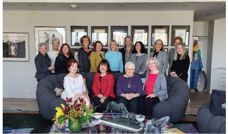
Ambassadors-At-Large Chapter Books for Kids Meeting

Fundraising/Special Events: "Antiques & Treasures in the Field", "Lake Forest Showhouse & Gardens", Smith's Mens Store Holiday Shopping Event, AngelBaby Bags, and Coat Drive